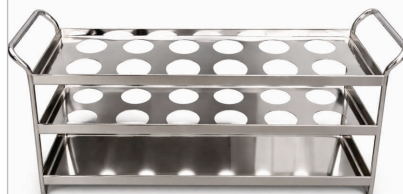
SS TEST TUBE STAND