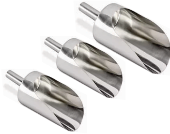
SS CLOSE TYPE SCOOP