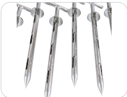
SS POWDER SAMPLERS