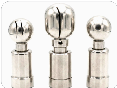
SS SPRAY BALLS