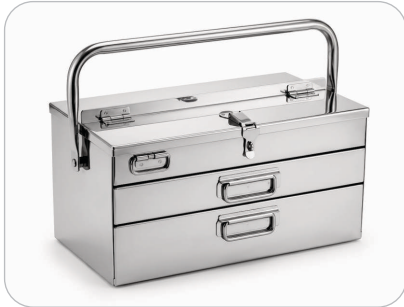
SS TOOL BOX