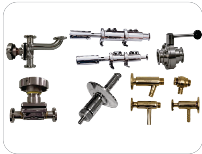
SS ZERO DEAD LEG VALVE, LOOP VALVE | DIAPHRAGM VALVE, SAMPLING VALVE | FLOW DIVERTER VALVE, BALL VALVE