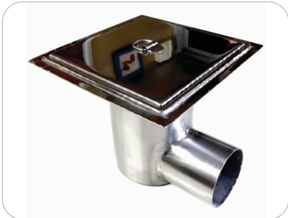
SS SIDE OUTLET GMP FLOOR DRAIN TRAP