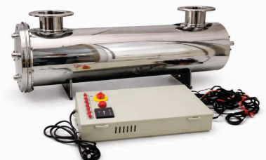
ULTRAVIOLET WATER STERILIZER (UV SYSTEM)