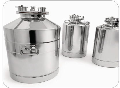
SS PRESSURE VESSELS