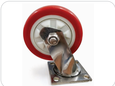
PU WHEELS WITH SS BRACKET