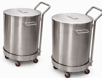
CONTAINERS WITH TROLLEY