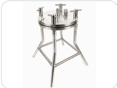
SS MEMBRANE HOLDER