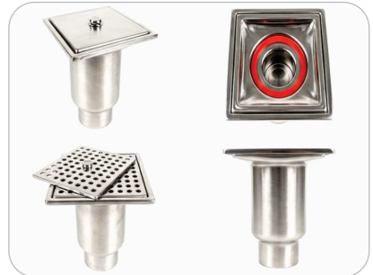
SS PHARMA FLOOR DRAIN TRAP