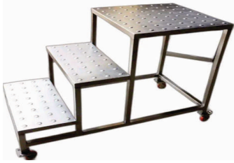
SS INDUSTRIAL STEP LADER