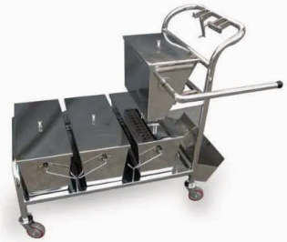
SS MOPPING TROLLEY