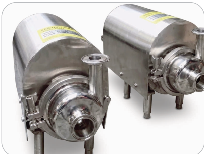
SS SANITARY PUMPS