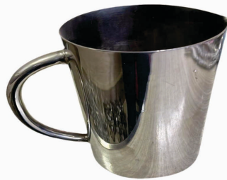
SS BEAKER JUG JAR/MUG