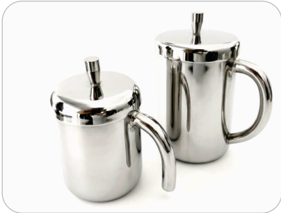
SS CONTAINER WITH LID AND HANDLE