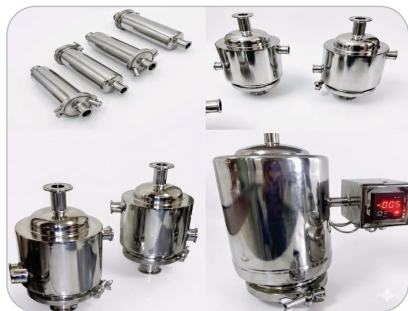
ELECTRIAL VENT HOUSING