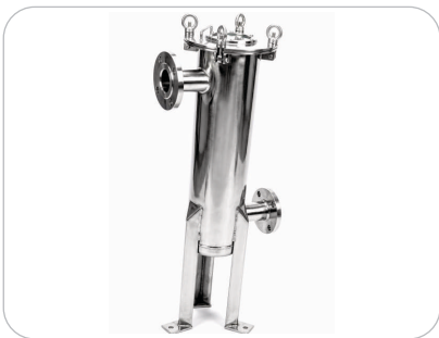
BAG FILTER HOUSING