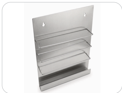
SS SOP STAND