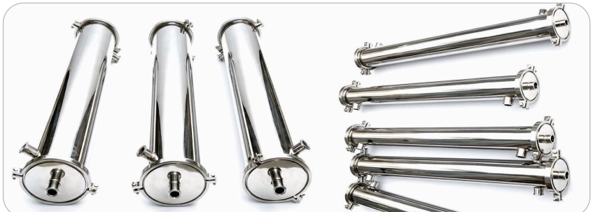
SS RO MEMBRANE HOUSING/ PRESSURE TUBES