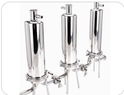
SS FILTER HOUSING