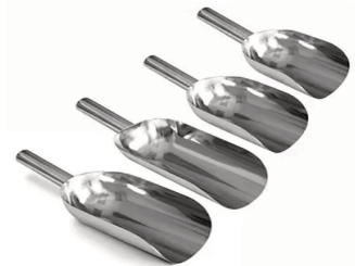
SS OPEN TYPE SCOOP