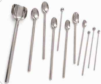
SS POWDER SPOONS