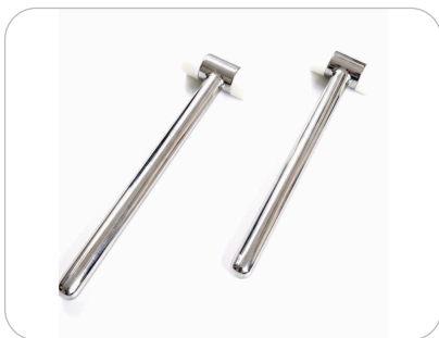
SS TEFLON HAMMER