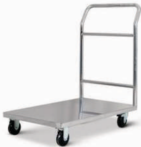
SS PLATFORM TROLLEY