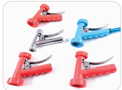
SS WATER SPRAY GUN